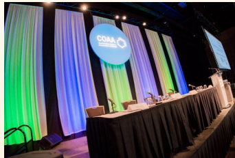
2016 Best Practices Conference